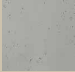
GREY | MB471