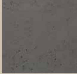
STORM | MB487