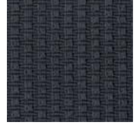
PLUM | MB336