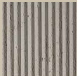
SMOKE | MB251