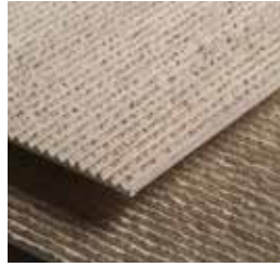
VESTA EARTH | MBT208