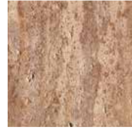
PERSIAN | MBT243