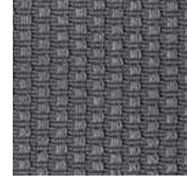
LINEN | MB328