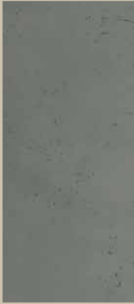
APRON | MB475