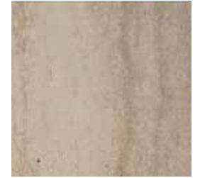
TERRAZZO | MBT251