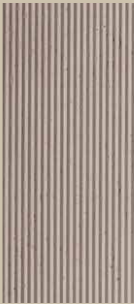
FLINT | MB236